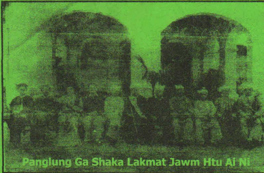
Panglung Ga Shaka Lakmat Jawm Htu Ai Ni